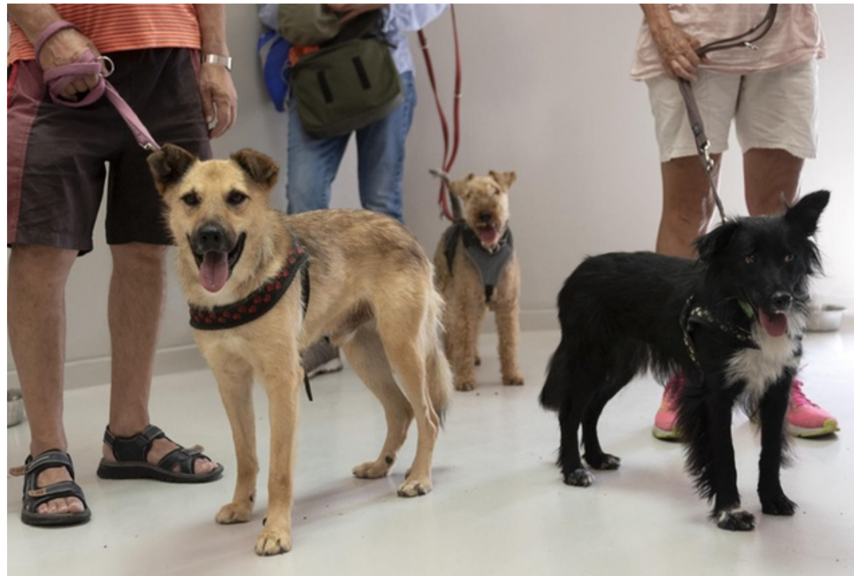
Most infringements (50.4%) concerned pets, mainly dogs.

The number of criminal proceedings related to the mistreatment of animals has increased, according to a Swiss animal welfare group.