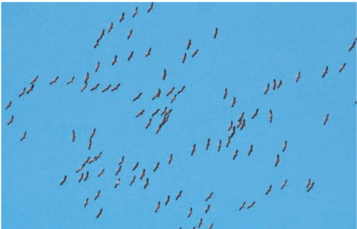
Common Cranes circle in order to find thermals for their flight across the sea.

A commendable new nature centre is now located on the road to Cape Greco as advertisement for the Natura 2000 bird protection area. The centre is directly beneath the bird migration bottleneck where, unlike wetlands reserves, the birds are observed from a tower—here the spectacle of migration takes place above the observers head.