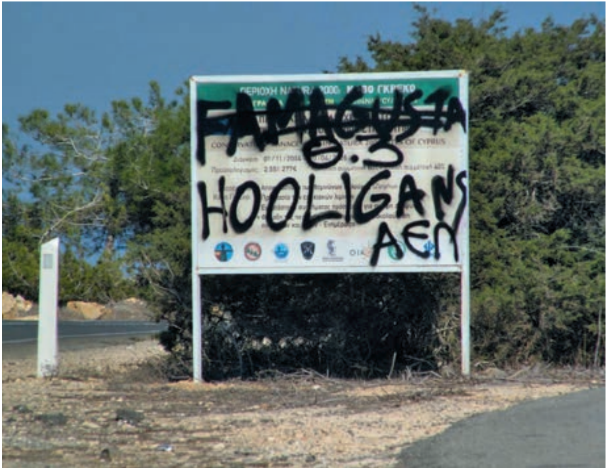
"Natura 2000 reserve" poster defaced by bird trappers.