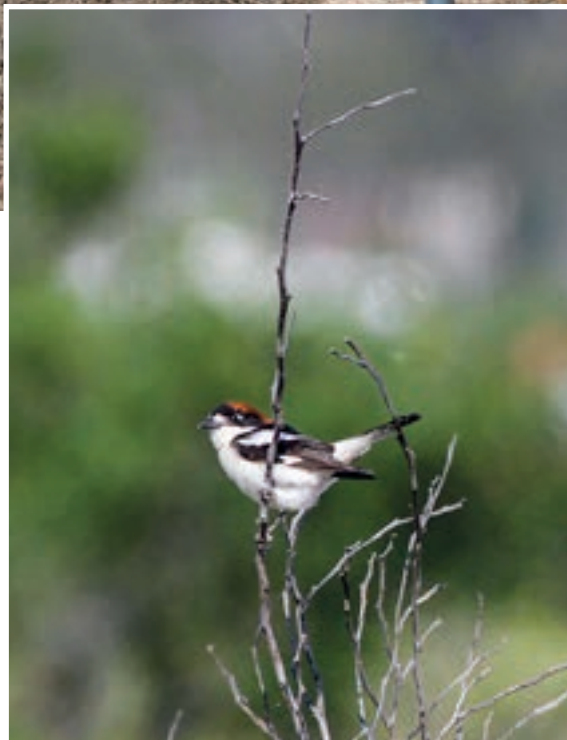
An important habitat for shrike species.

The Cyprus forest department is taking the enhancement of the buffer zone seriously.