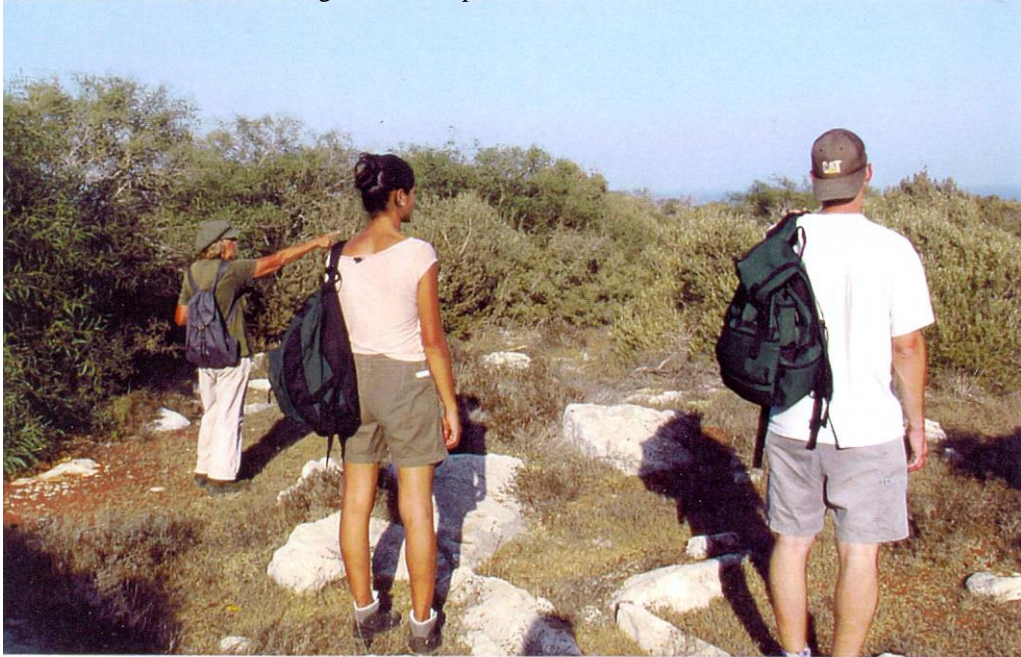
Monitoring team in cooperation with the Game Fund